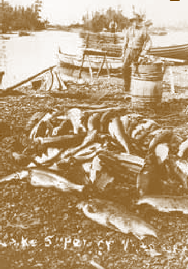
A catch of whitefish and trout. The man standing by the barrel of fish is unidentified.