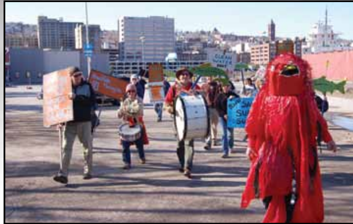
With the ore carrier William A. Irvin in the background, concerned citizens are seen marching around the DECC, protesting the proposed PolyMet sulfide mining operation in Babbitt.

People came to the meeting to talk to the commissioners about topics important to