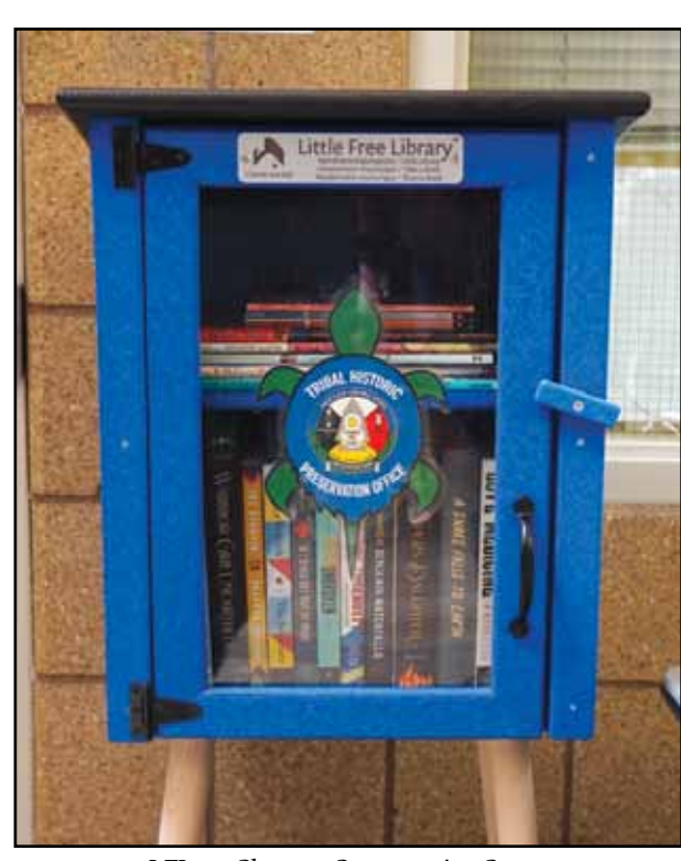
LFL at Cloquet Community Center