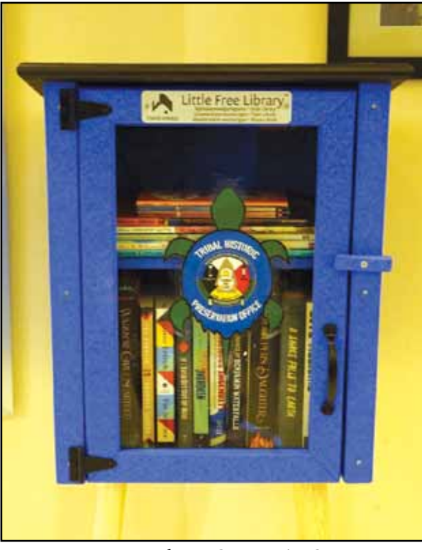
LFL at Brookston Community Center